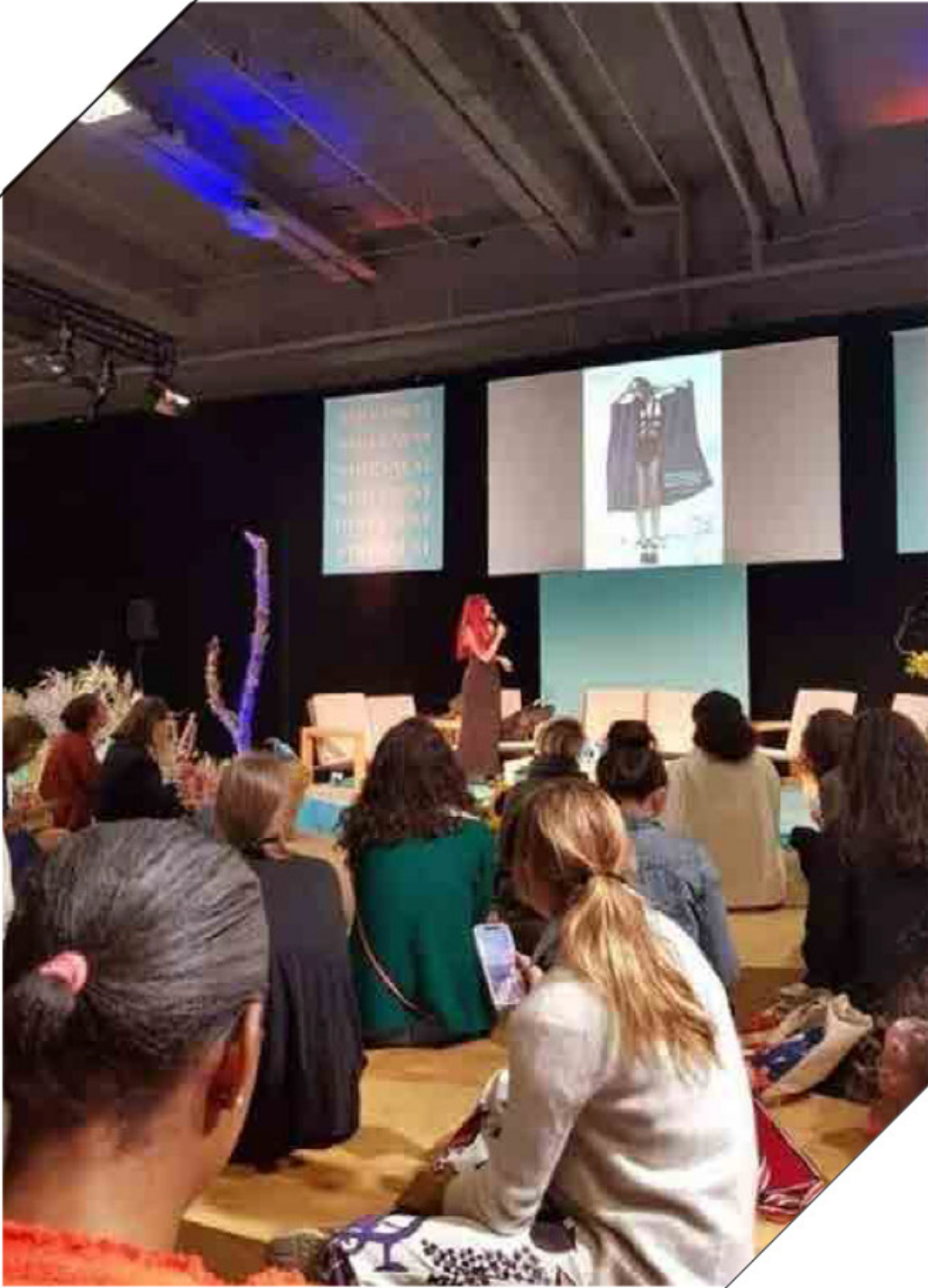
"Fashion Ecology" conference on IMPACT X WHO'S NEXT, Porte de Versailles, Paris

/ CERTIFICATION / PEDAGOGY / SPECIALIZATION