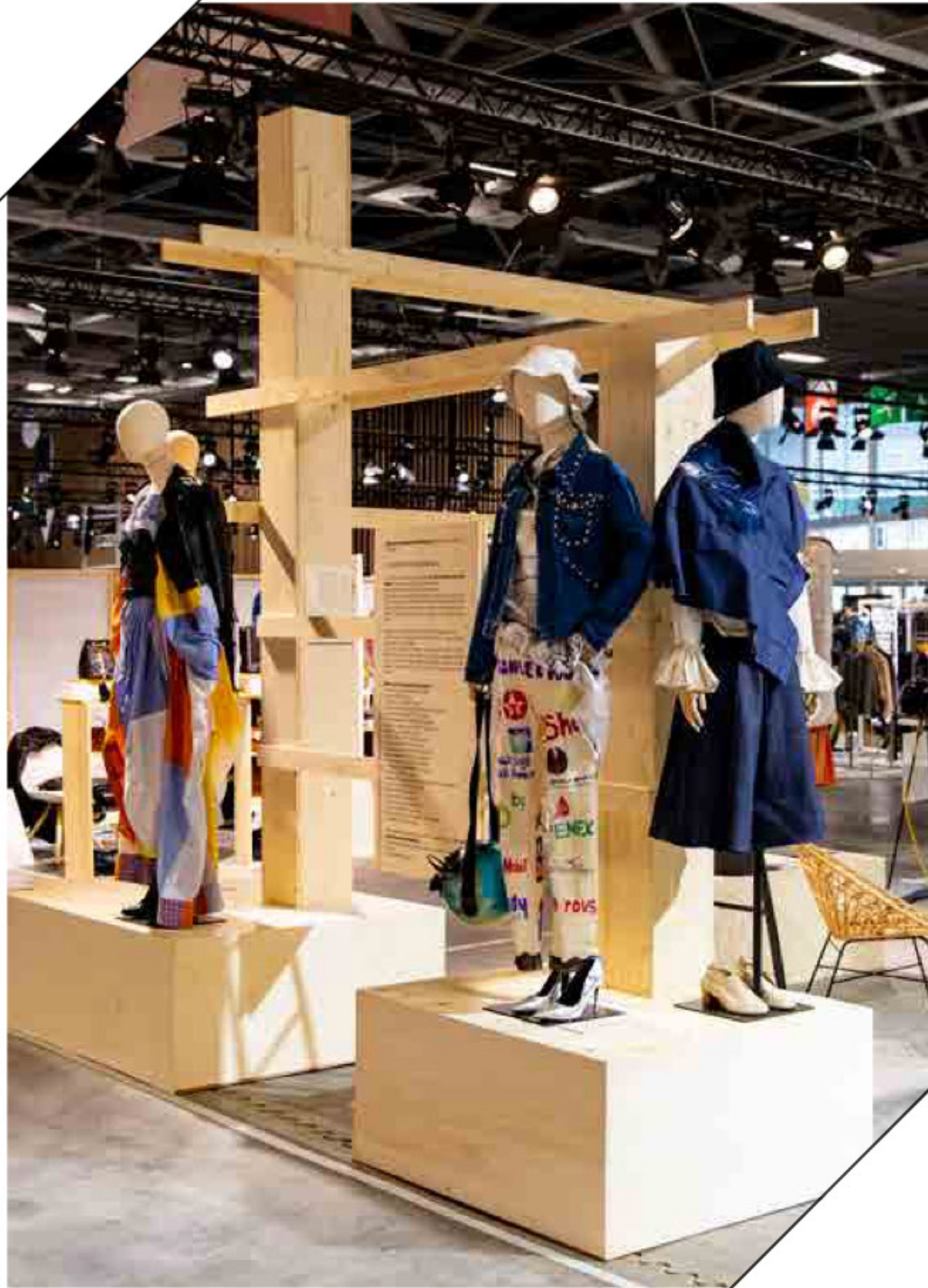
Artistic direction and styling of the exhibition WHO'S NEXT X IMPACT «Slow down and inspire», Label UMAP, Photography: Yannick Roudier.

/ WORKSHOP / TRAINING / CONSULTING / COLLECTIVE